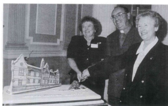
At the 21st Anniversary celebration in the National Library. A slice of history!